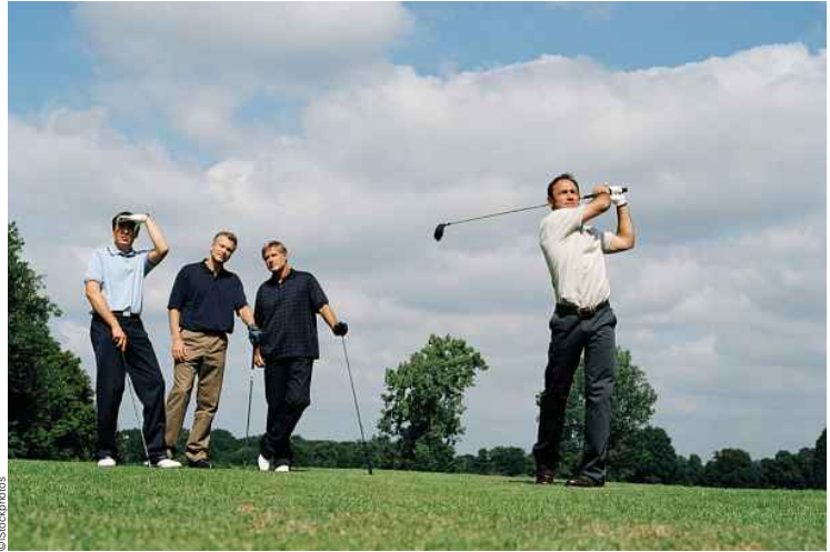
Golfing buddies don't provide independent advice